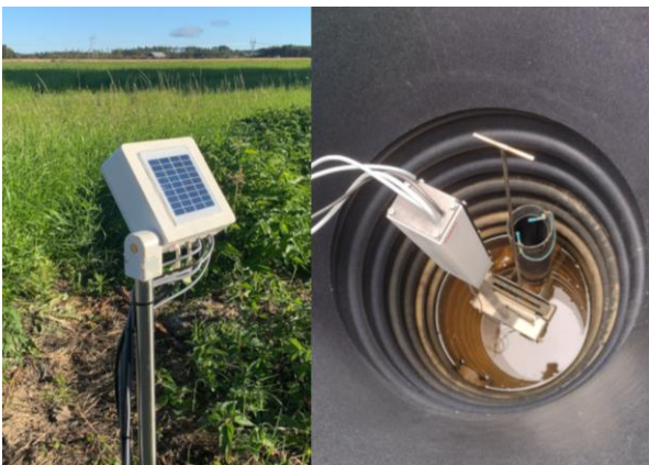
Fig 2. Prototype of controlled well installed to test area.

The control well hardware has been tested at various field sites around Kannus, Nivala, and Ruukki during the fall and summer of 2021 and 2022. The main challenges were in optimizing energy use and maintaining reliable communications. Some issues were found regarding the quality of components, especially the cellular radio modules which were found to be somewhat unreliable and inefficient. The tests, however, proved the concept feasible and means of improving reliability and energy use were identified and partially implemented for ongoing tests through 2023. The results indicate that further hardware and software revision will make autonomous all-year-round operation possible regardless of the lack of sunlight during December and January.